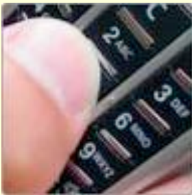
managing cyber bullying